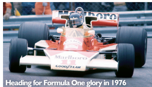
Heading for Formula One glory in 1976

The £1 million fortune Hunt amassed had been swallowed up in an expensive divorce settlement and failed business ventures.